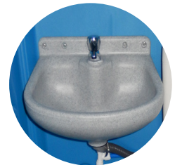
Large wash basin