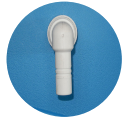
Fresh water inlet on back of unit