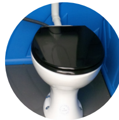
Durable ceramic toilet pan & plastic cistern